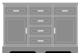
DOBF62S48 48W 18D 32H