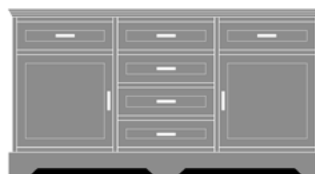
DOBF62S60 60W 18D 32H