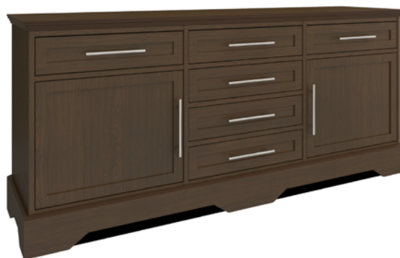
Model: DOBF62S72 72W 18D 32H

The Dorchester Credenza Station combines traditional detailing with modern architectural lines, while providing plenty of storage. There are three sizes to suit your needs with black panels behind the plinth base, which act as dust traps, for ease of cleaning. There is more than enough storage in the credenza's six drawers and two side cabinets, which contain adjustable shelves.